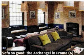
Sofa so good: the Archangel in Frome (6)