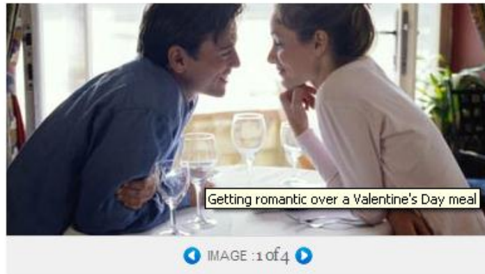
Getting romantic over a Valentine's Day meal

Kiddie alert: Valentine's falls at half-term this year — but don't worry, we know where you won't be disturbed